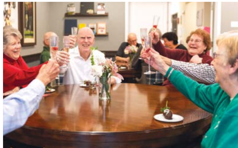
Above: Cheers! Willows Bend residents lift a glass