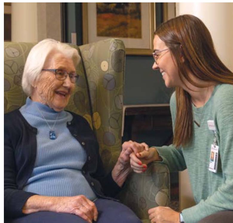
Below: Resident and team member at Oak Meadows