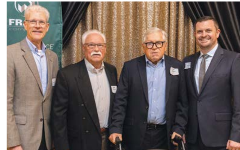
Top: The Pillars of Prospect Park Dance Team