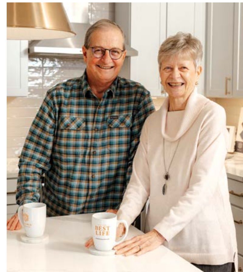
Below: Estoria Cooperative Lakeville member-owners make selections for their new home