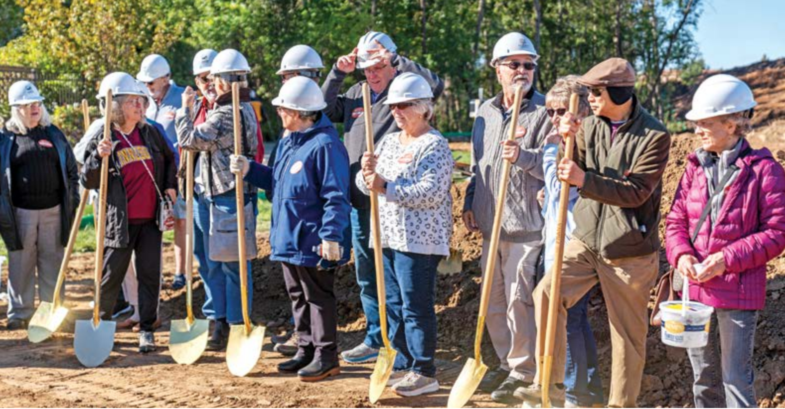
Above: Member-owners break ground at Estoria Cooperative Oak Marsh