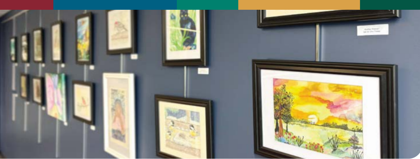
Resident art gallery located at Ebenezer Corporate Offices in Edina, MN