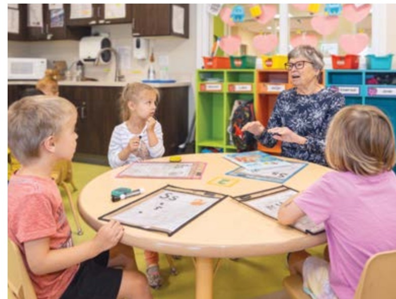
Top: Members of Team Ebenezer at the Walk to End Alzheimer's