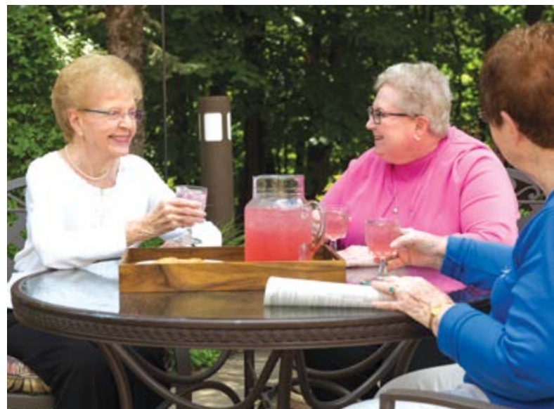
Below: Martin Luther residents enjoying a beautiful day