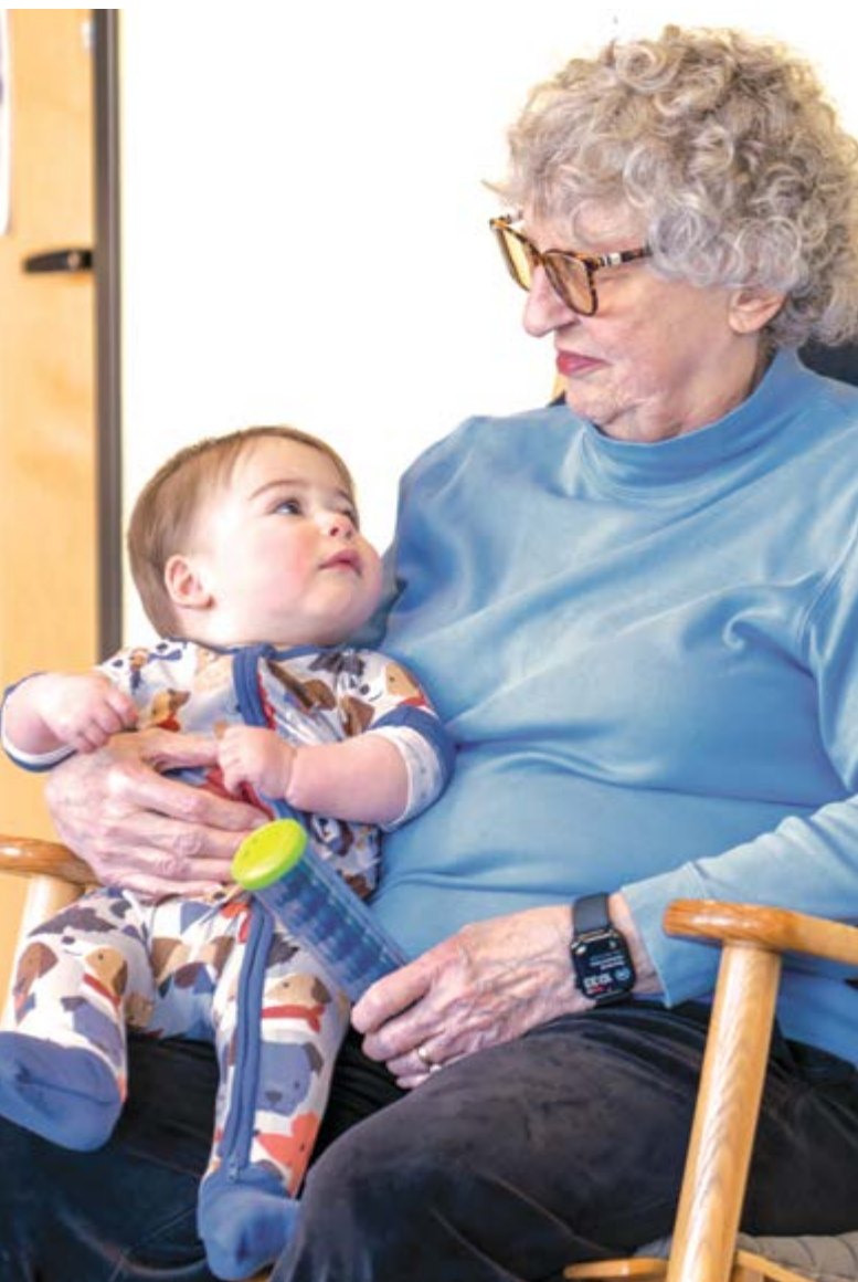
Below: TowerLight resident and child connecting